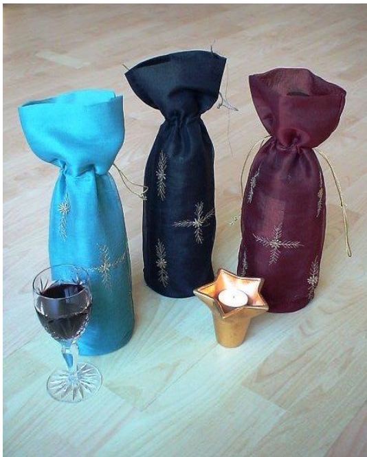
35693 Turquoise, Black, Burgundy Lurex gold embroidery