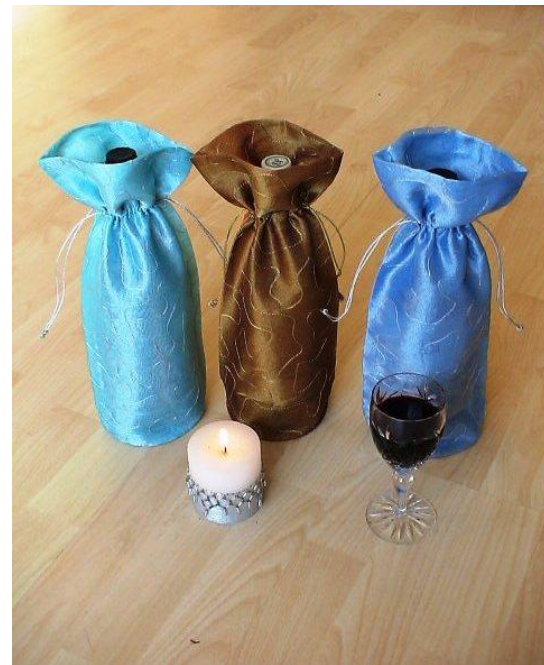
PT158 Jade, Gold, Blue Metallic double tone silk embroidery