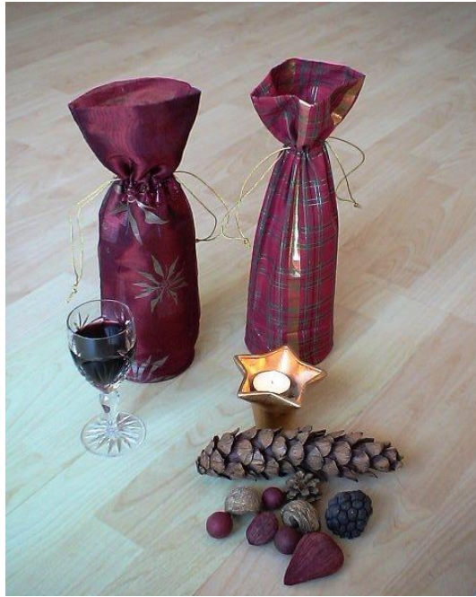
29404 Red PT1066 Red Tartan Organza Snow Flake/ Satin sheen checked