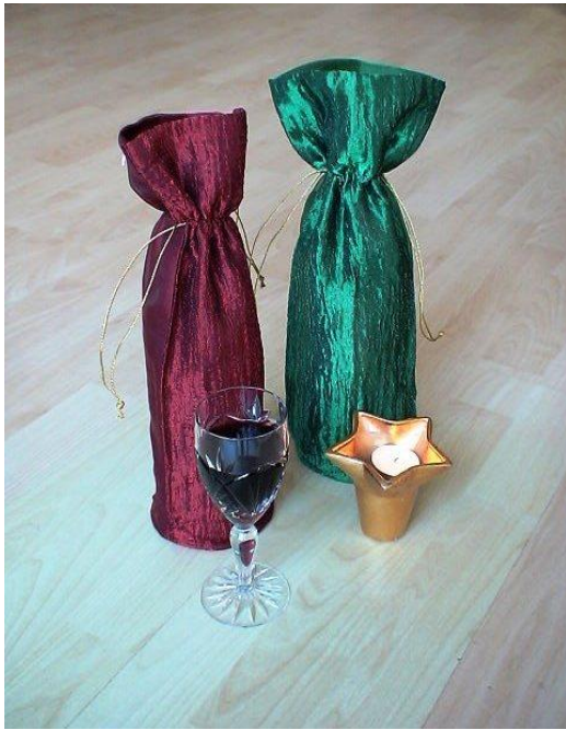
35692 Red, Green