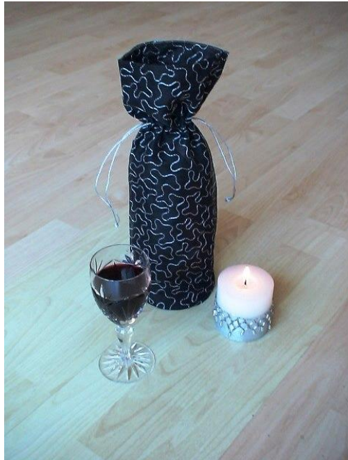
PT397 Black Organza silk thread embroidery