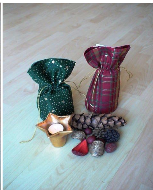
PT807 Green PT2229 Red Gift bags for small brandy and spirit bottles