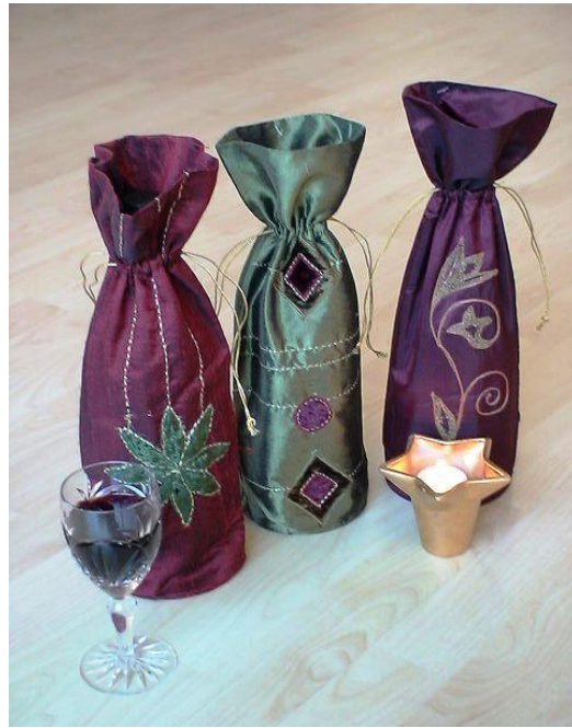
34416 Burgundy, 35704 Green, 35691 Burgundy Satin Silk with silk thread embroidery And velvet patch work