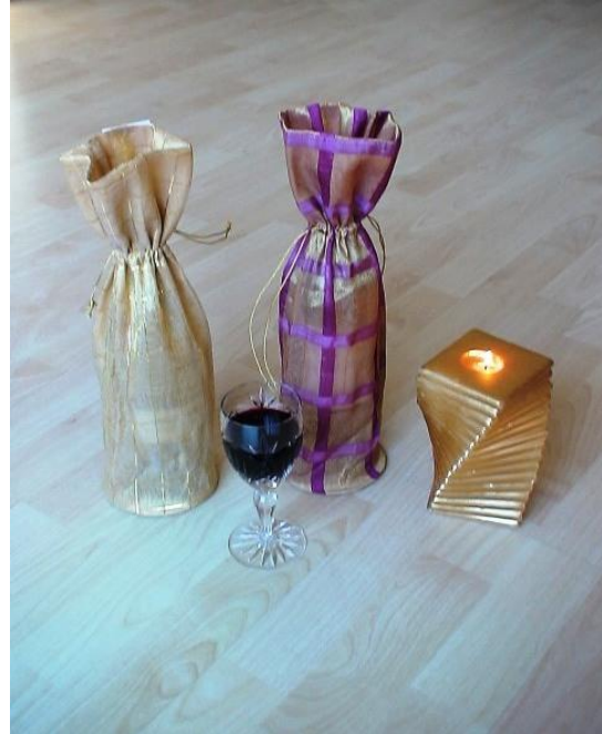
PT522 Gold PT395 Gold Organza checked gold and gold with purple checks