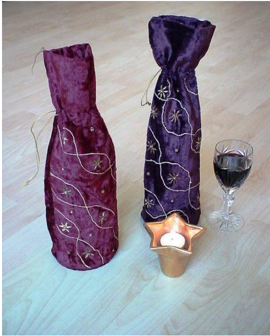
34162 Burgundy, Purple Rich Velvet with gold embroidery