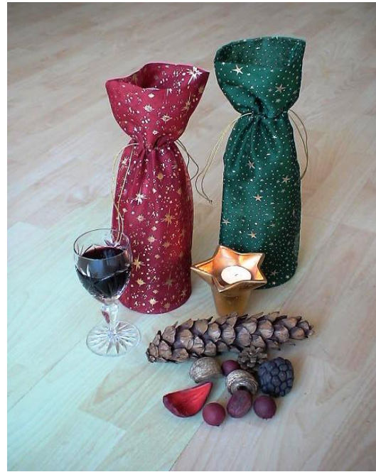
PT2229 Red PT807 Green Organza with gold stars