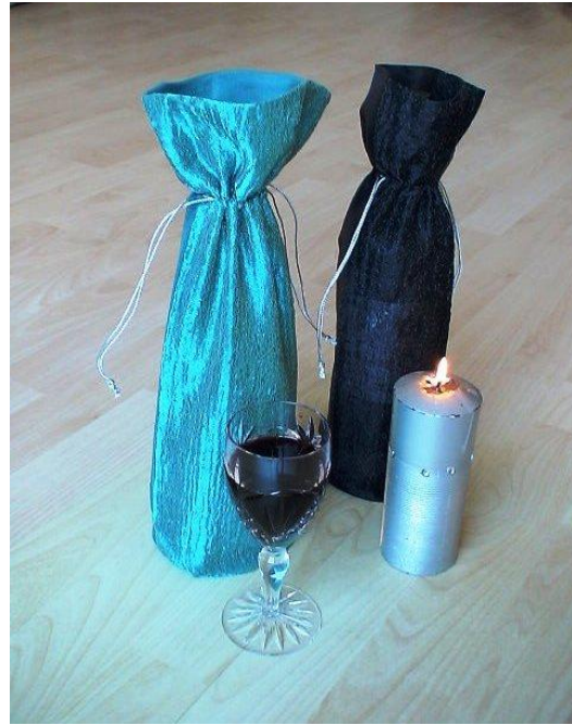
35692 Turquoise, Black