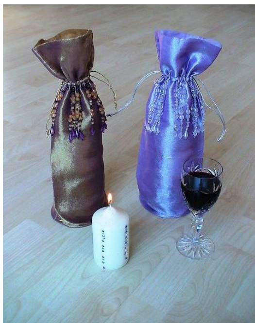
PT158 Gold, Lilac Lurex polyester metallic double tone with beads