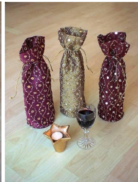
PT1014 Available in Blue, Green, Silver, Fuchsia, Gold, Red Organza exclusive embroidery range